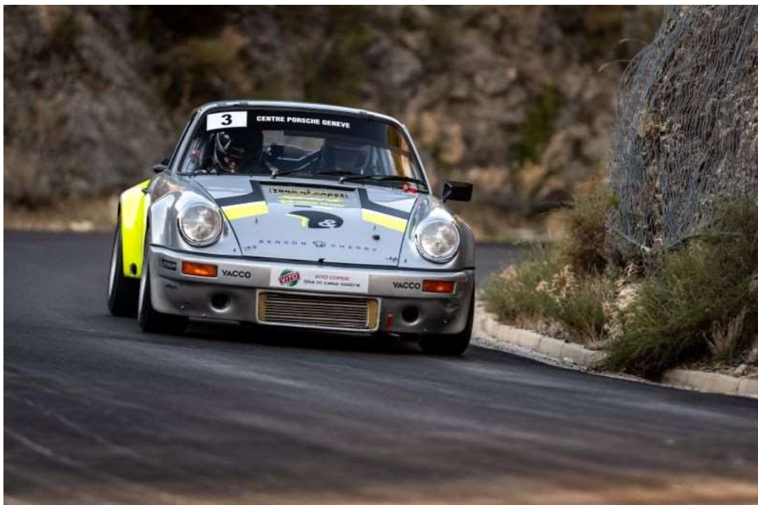
Romain Dumas and Denis Giraudet (Porsche 911) winners of the 2023 edition.

After scoring their first win in 2016, the Romain Dumas / Denis Giraudet duo in a Porsche 911 won the 23rd edition of the Tour de Corse Historique achieving the scratch time in the last special stage of the rally to finish in blaze of glory!