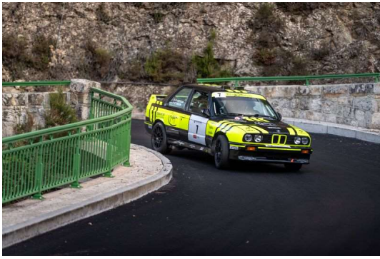
Christophe Vaison/Pascal Duffour (BMW M3).